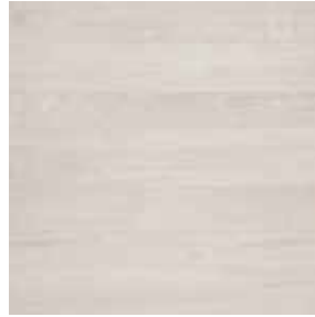
AXI White Pine