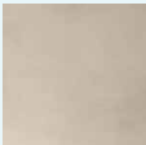
Boost Balance Ash