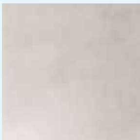
Boost Balance Pearl