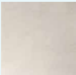
Boost Balance White