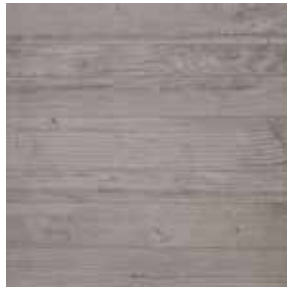
AXI Grey Timber