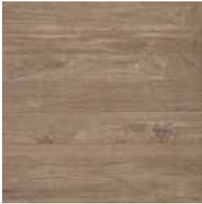
AXI Brown Chestnut